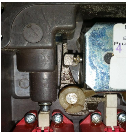
6) Pull the Below Lever Back (Left Figure) Put Top Block in Place & Hold Down While Replacing the Screws