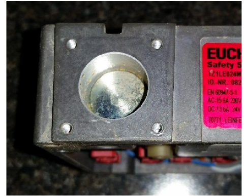
3) Clean Inside Piston