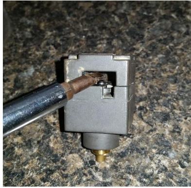
2) Carefully Pry Open