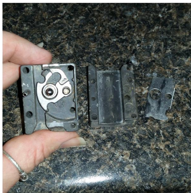
4) Clean All Parts Inside Top Block with Rubbing Alcohol