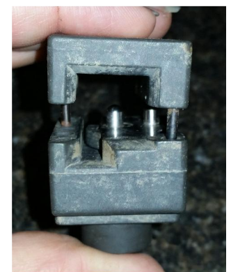
5) Press Together